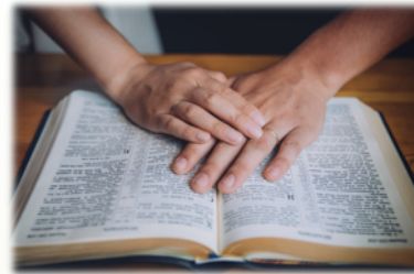
FALL BIBLE STUDY