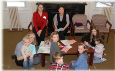
CHILDREN'S RELIGIOUS EDUCATION