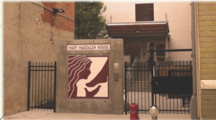
Mary Magdalen House