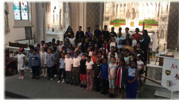
2019 All-School Spring Concert