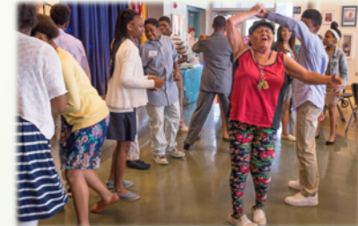
Mercy Neighborhood Ministries